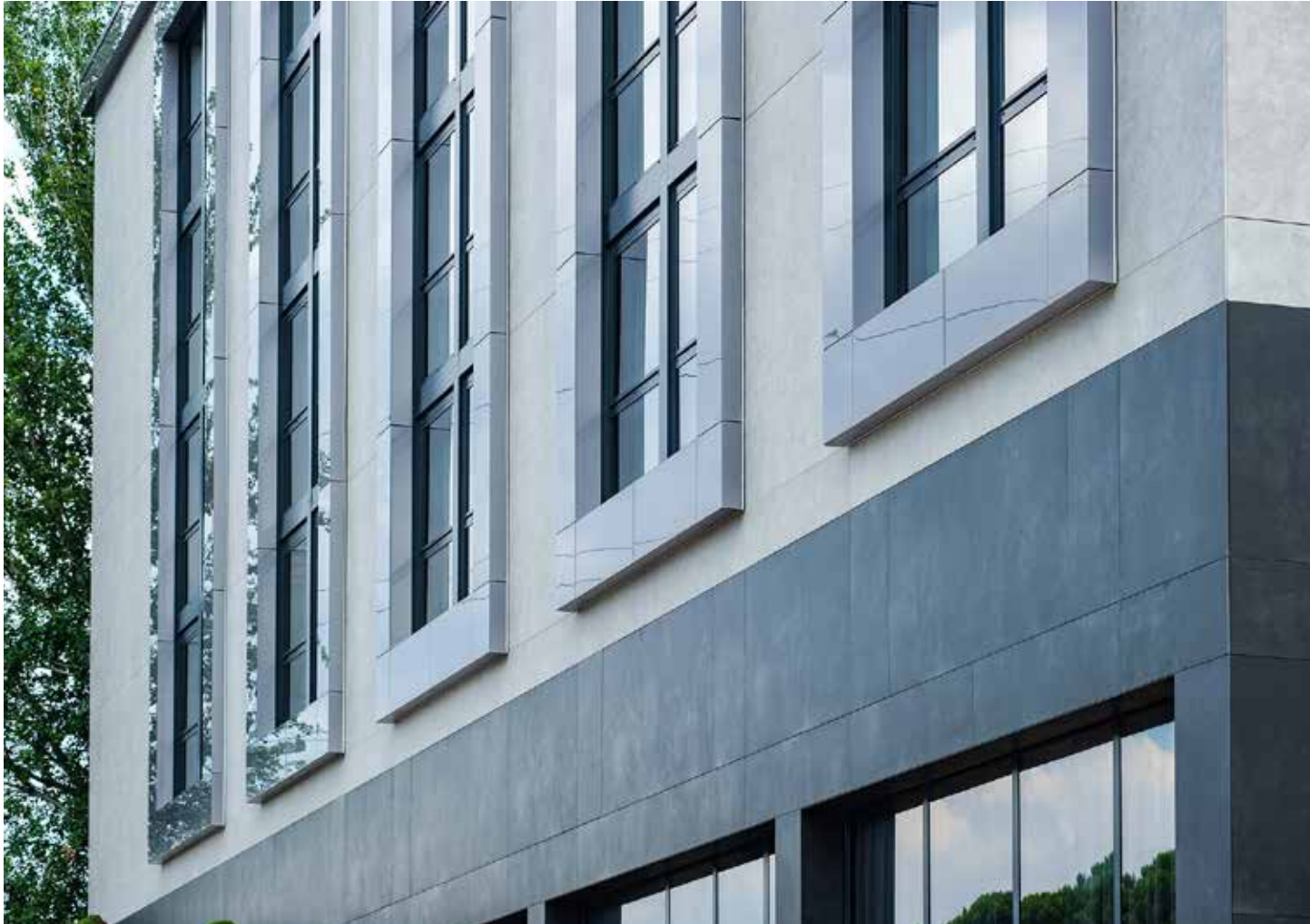
Column ————— • String-course ————— •